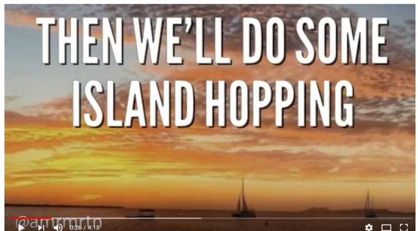
iAM ft D'antonio - Lost in the Caribbean (Lyrical Video)