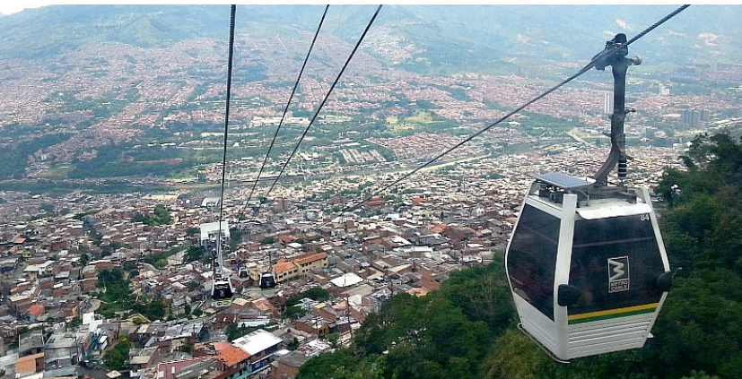
<- Metro Cable Medellín

Metrocable is a gondola lift system implemented by the City Council of Medellín.