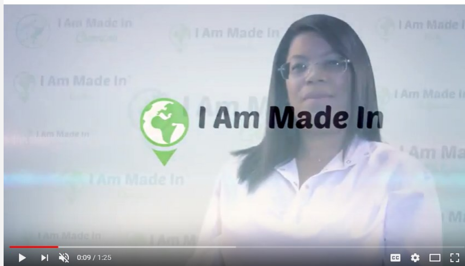
Introduction to I Am Made In platform

Por favor, encuentre más información sobre I Am Made In.