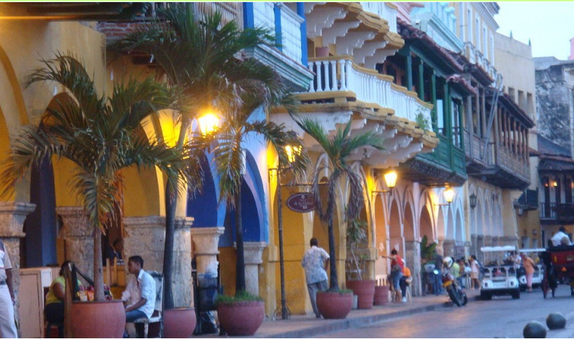
Las Lajas Cathedral, Department of Nariño ->

<- Port city Cartagena . Part of its famed walled city and fortress, is designated a UNESCO World Heritage site in the 80s.