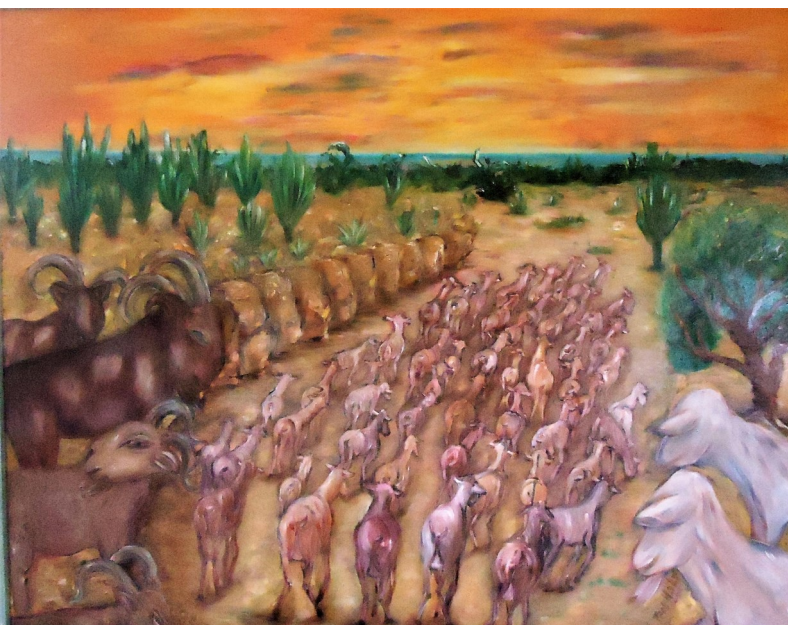
North Coast Goats 1 mtr.-1.20 atholt oil canvas '95

Her two ultimately exhibits were 'Rastro'(Track) with 8 artists from lower Antilles and 'Artistical Heritage' indicating the Cultural view of 2 Artists from decades. Asyla's Love is also Prose writings and dedicates in launching her new book 'Enliven Emotions' since last year and prepares for a second book. She also works with Installation.