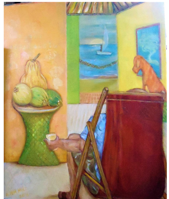
integrated 2012 oil canvas 80 cm-1 mtr. atholt

narratives in Sur-real aspects and Abstract taste of figures. Her two ultimately exhibits were 'Rastro'(Track) with 8 artists from lower Antilles and 'Artistical Heritage' indicating the Cultural view narratives in Sur-real aspects and Abstract taste of figures.